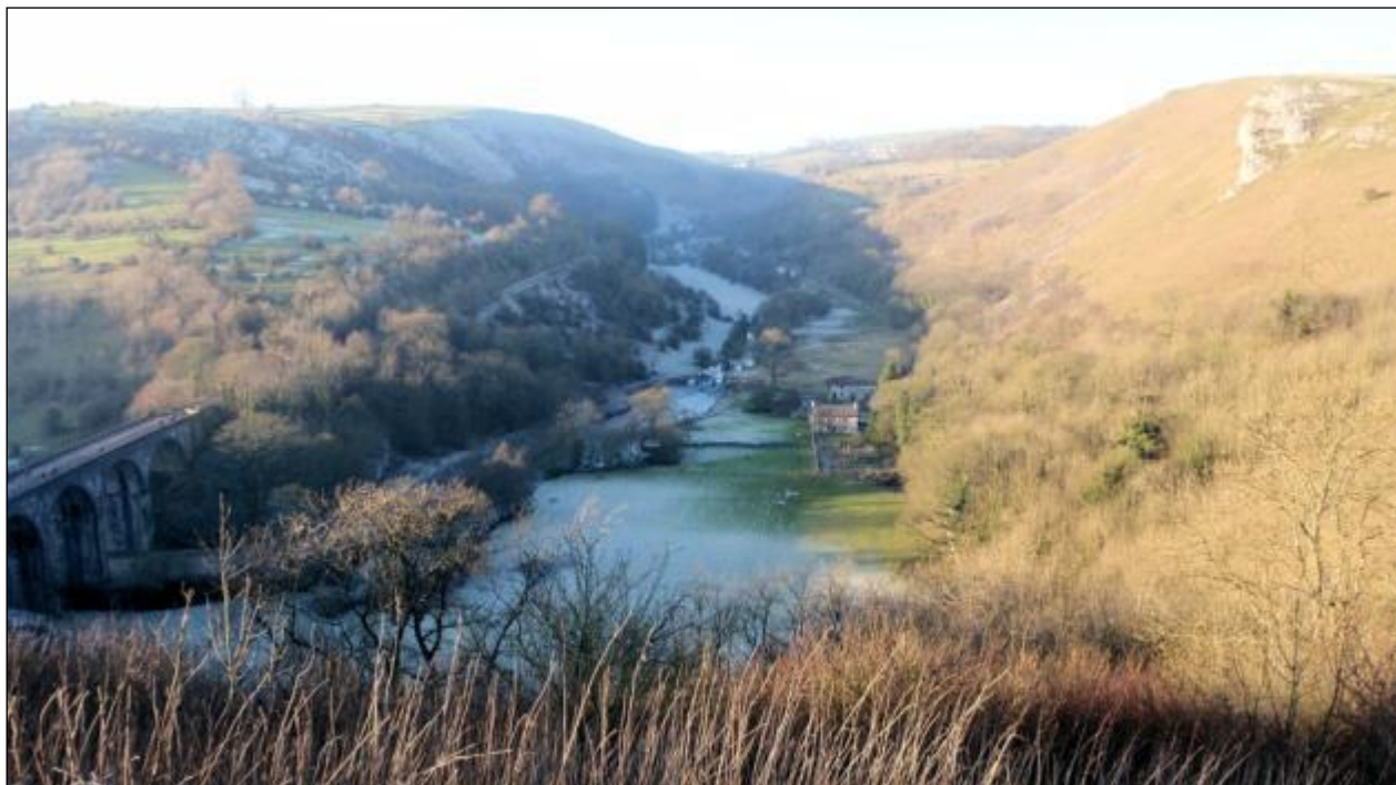
View from Monsal Head.

(park near the top of minor road opposite the hotel – Little Longstone road).