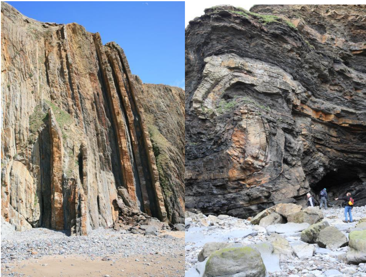
Three Chimneys, Marloes Sands & Den's Door, Broadhaven.

Bookings have now closed for this field weekend but if you arrange your own accommodation you are still welcome to come and join us. Please contact the field secretary if you are interested.